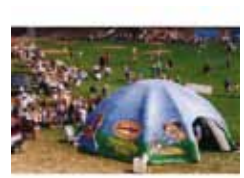
Kids Play Areas

© 2012 Dynamic Air Shelters. All rights reserved.