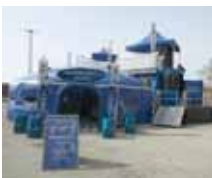
Your Own Designs