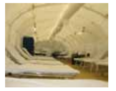
First Aid Tent